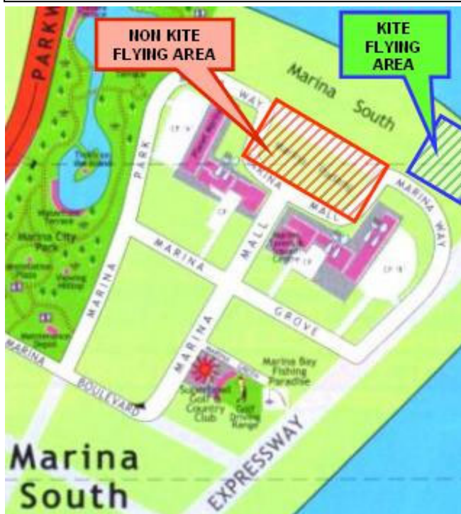
Map featuring the location of kite flying area and the non-kite flying area.

http://www.ssc.gov.sg/2002/marinasmouth.shtml